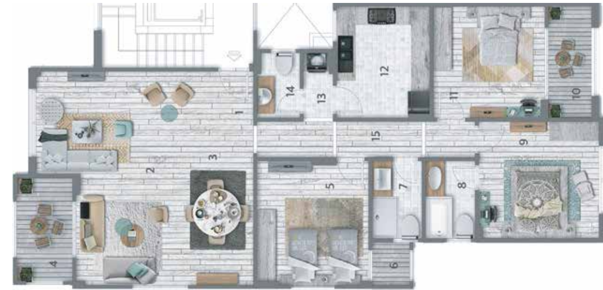
Typical Floor - Area 175 m 2