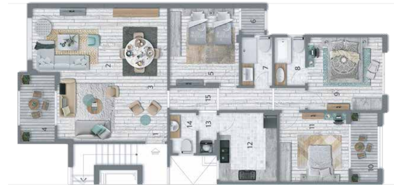
Typical Floor - Area 175 m 2