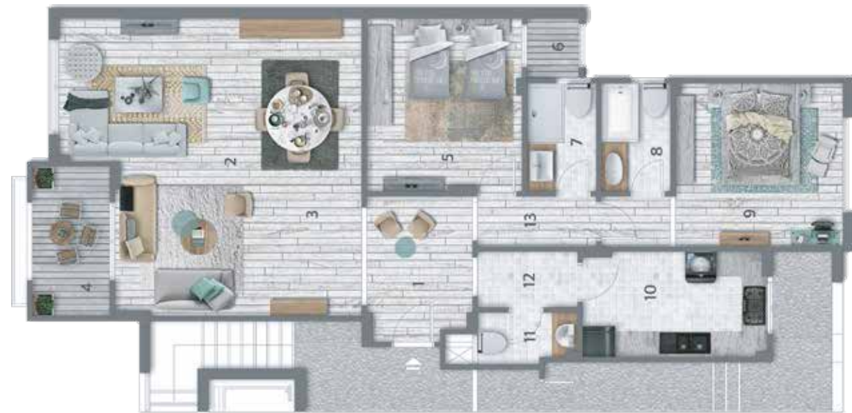
Ground Floor - Area 155 m 2