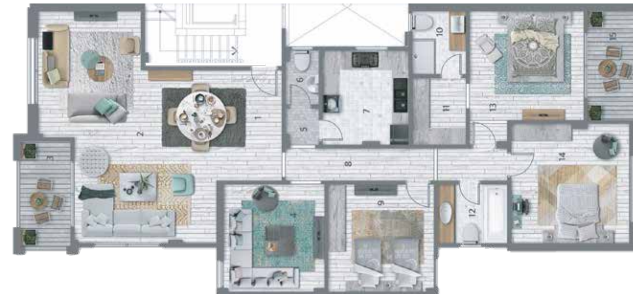
Typical Floor - Area 220 m 2