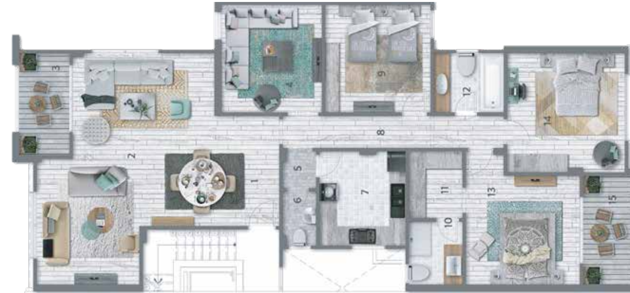
Typical Floor - Area 220 m 2