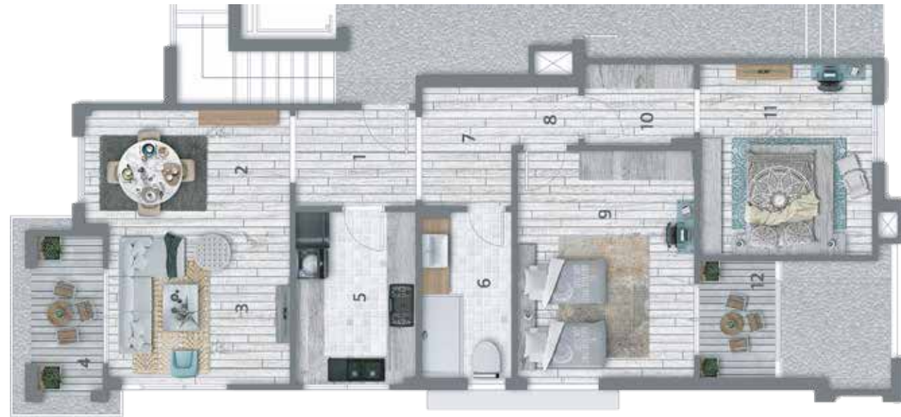
Ground Floor - Area 128 m 2