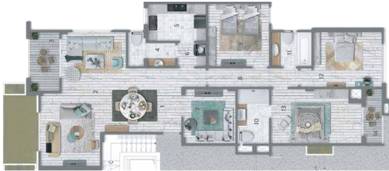
Ground Floor - Area 200 m 2