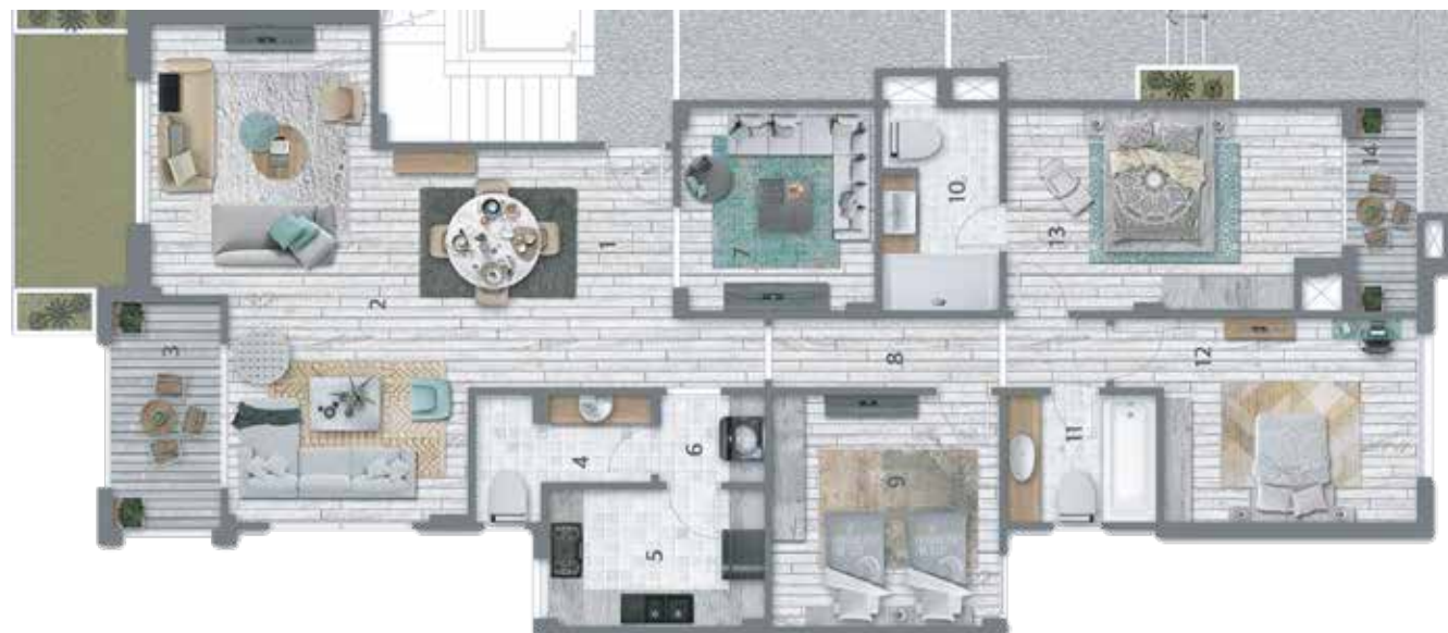
Ground Floor - Area 200 m 2