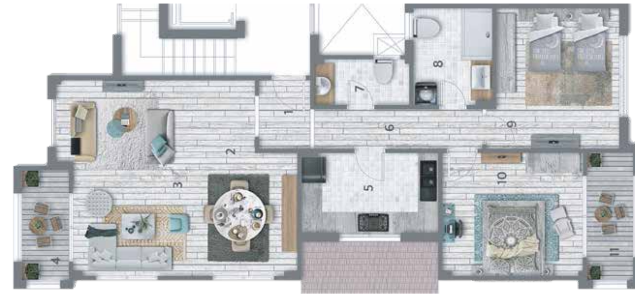
Typical Floor - Area 140 m 2