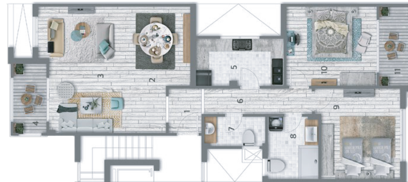
Typical Floor - Area 140 m 2