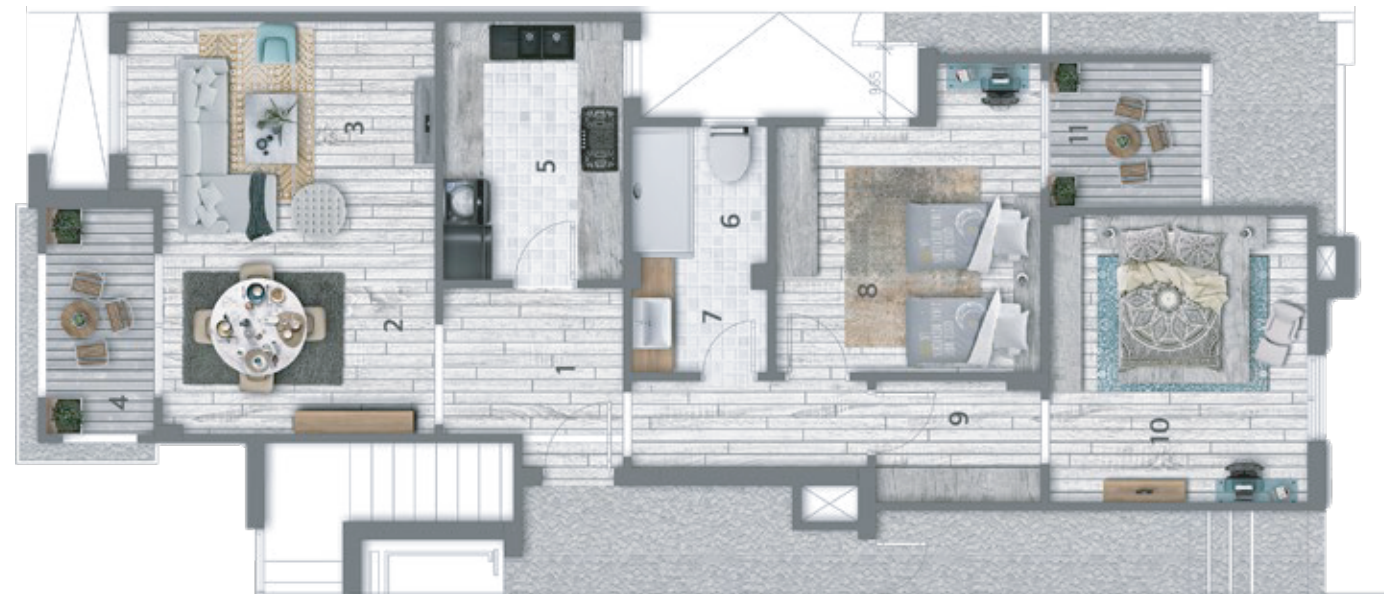
Ground Floor - Area 128 m 2