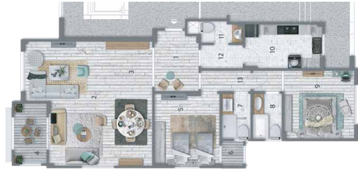
Ground Floor - Area 155 m 2